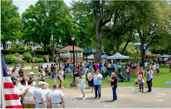
Pridefest in the Park