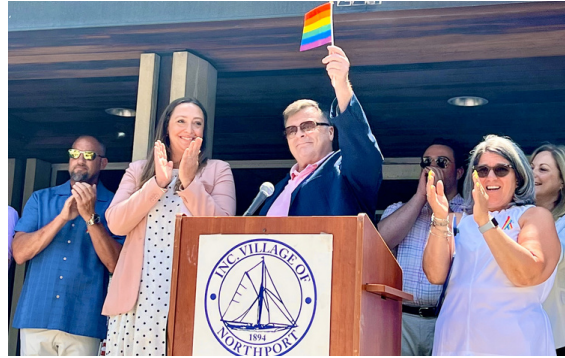
Pride Flag Raising Ceremony