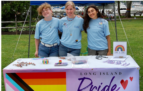
Vendors at Pridefest in the Park