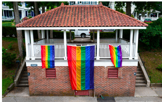
Decorations at Pridefest in the Park