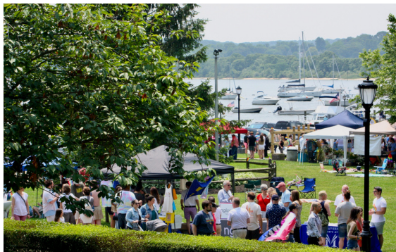
Pridefest in the Park