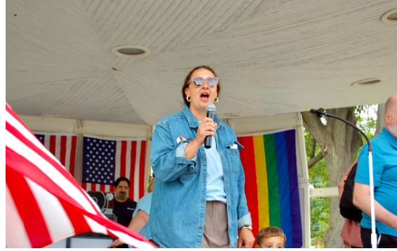
Featured Performances at Pridefest in the Park